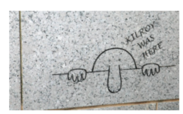
Kilroy is even engraved it the WWII Monument in Washington D.C. as shown here in granite.

We have a complete and interesting story waiting for you on site